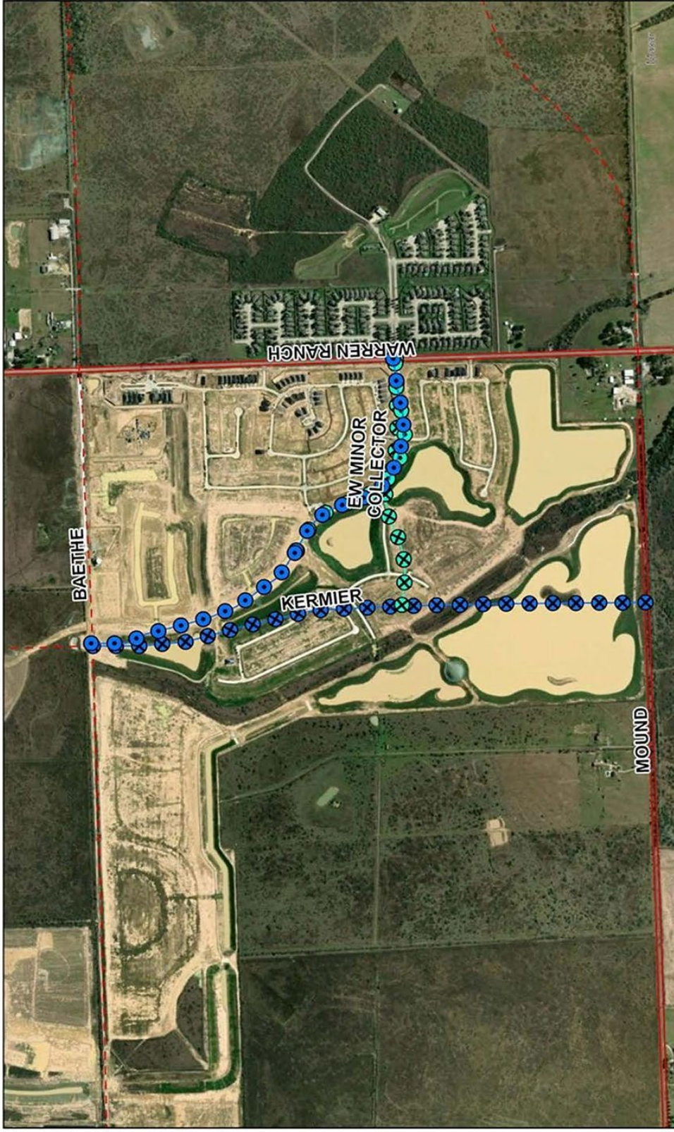
F. Kermier Road / EW Minor Collector - 2024 Major Thoroughfare and Freeway Plan Amendment Request