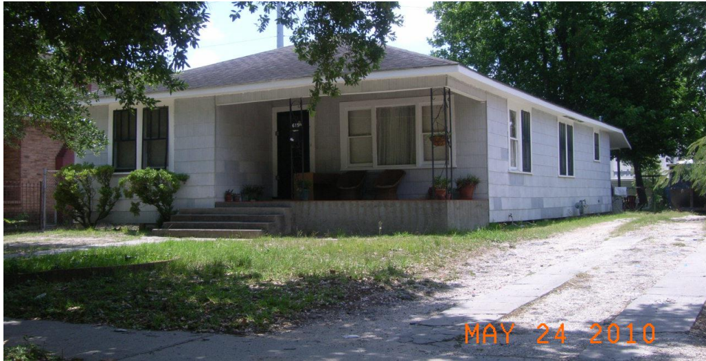
Google Images Dated From April 2022