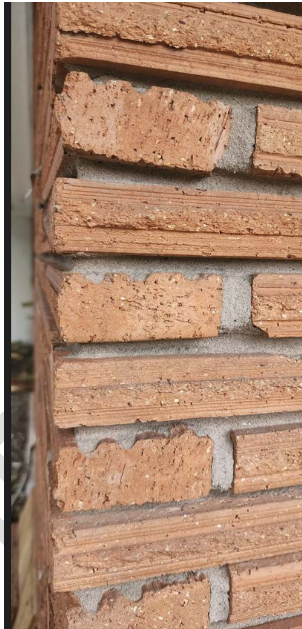
Figure 1: Existing brick and mortar