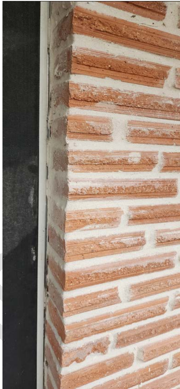
Figure 2: Existing brick with different color mortar