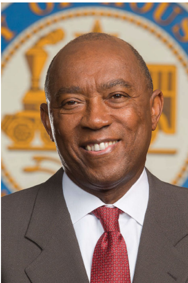
Sylvester Turner Mayor City of Houston