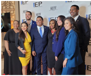
IEP INTERNATIONAL ENTERTAINMENT PARTNERSHIP