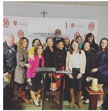
HOUSTON 2036 TASK FORCE