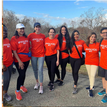
FIT HOUSTON #WALK30