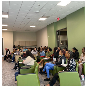
WEST HOUSTON INSTITUTE ALIEF