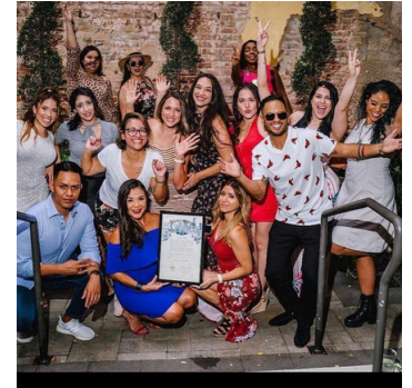
PROCLAMATION CHAMPIONS CLUB DAY