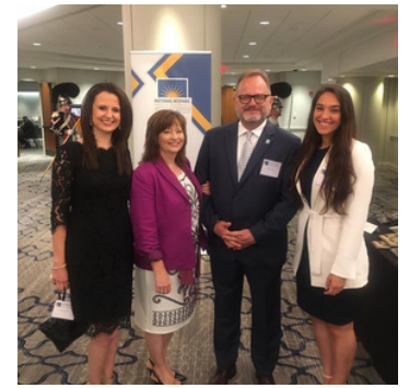
CAPITOL HILL WASHINGTON DC