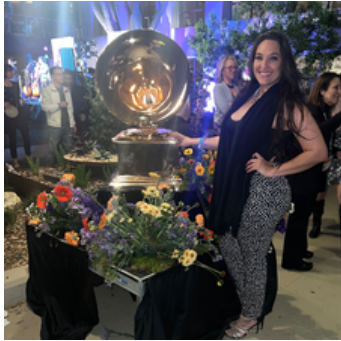
LATIN GRAMMYS AUSTIN