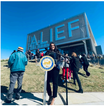
ALIEF HISTORY MAKING