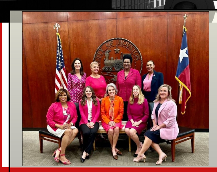
Women on City Council