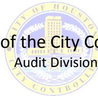
EXHIBIT 1 ACKNOWLEDGEMENT STATEMENT