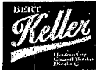
Exhibit # 3

To: Council Member Annise Parker, Chair Fiscal Affairs & Management Initiatives