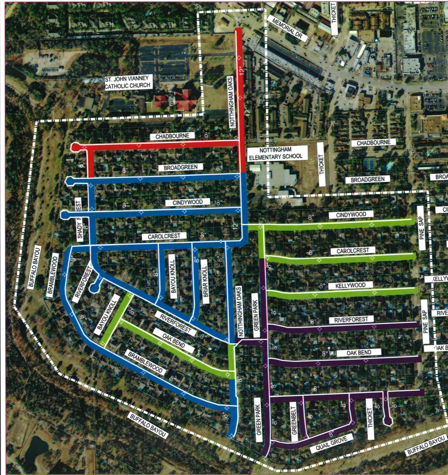
WESTCHESTER II AREA