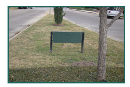
Glendower Court Neighborhood Entry Marker - Before

Click photo(s) below for full-size versions