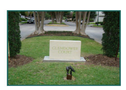
Glendower Court Neighborhood Entry Marker - After