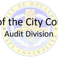
EXHIBIT 1 ACKNOWLEDGEMENT STATEMENT